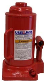
D-51126 20 Ton