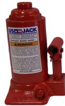
D-51124 8 Ton