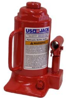
D-51125 12 Ton