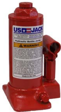
D-51122 3 Ton

100% American Made.....with American Pride