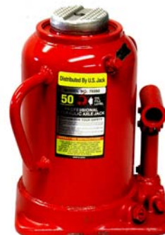
D-51150 50 Ton * IMPORT