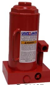
D-51127 30 Ton