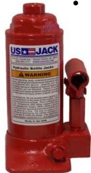
D-51123 5 Ton