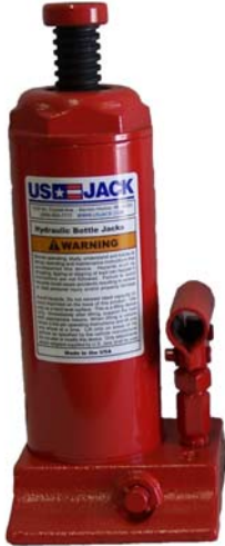
D-51013 8 TON