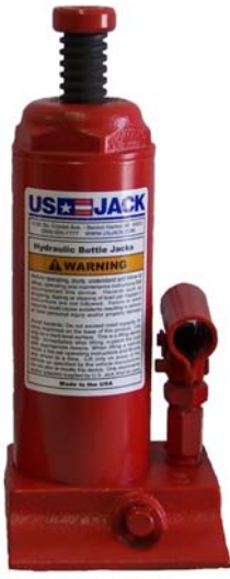
D-51012 5 TON