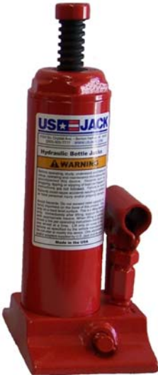
D-51011 3 TON

100% American Made.....with American Pride