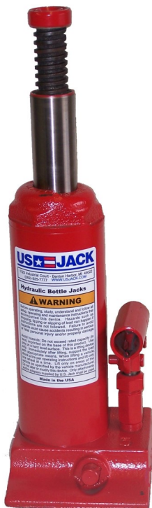
D-51012 5 Ton