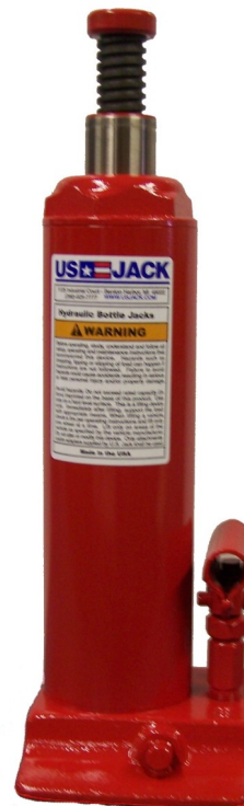
D-56160 8 Ton