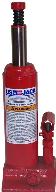
D-51011 3 Ton