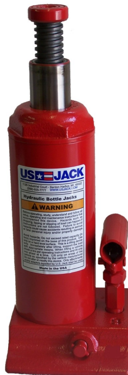
D-51013 8 Ton