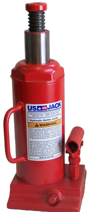
D-51014 12 Ton