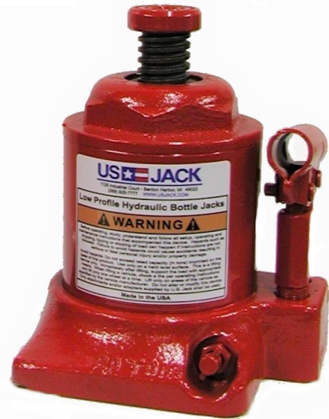
D-51126-5 20 Ton