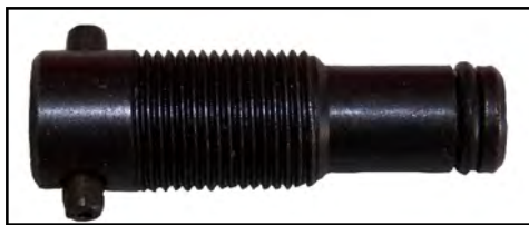
P - One (1) Piece Release