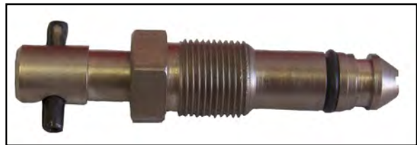
2P - Two (2) Piece Release