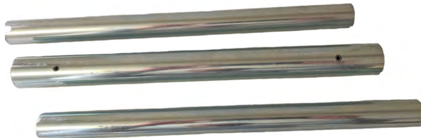
56340 - Three (3) Piece Handle Set