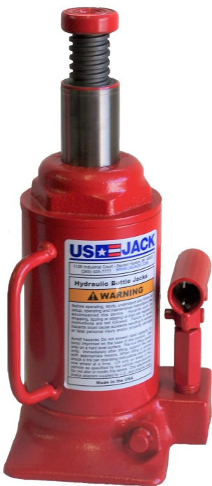
D-51125 12 Ton