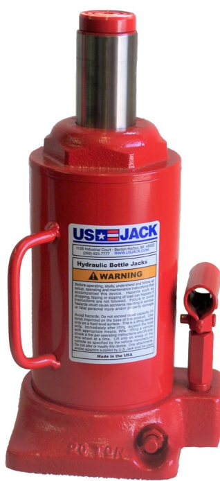
D-51126 20 Ton