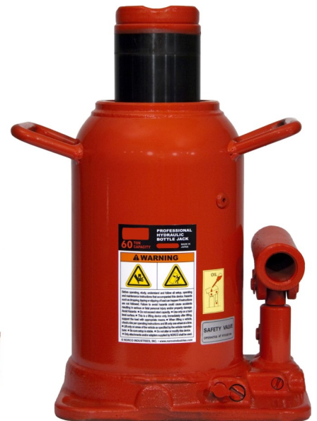
D-51160 60 TON * IMPORT