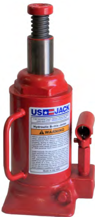
D-51125 12 Ton