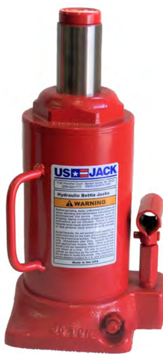
D-51126 20 Ton