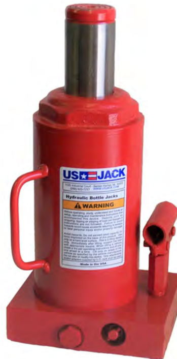
D-51127 30 Ton