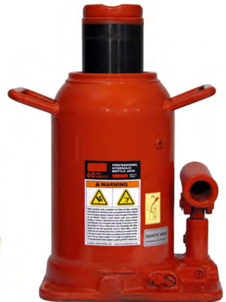
D-51160 60 TON * IMPORT